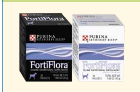
Figure 1. FortiFlora for dogs and cats